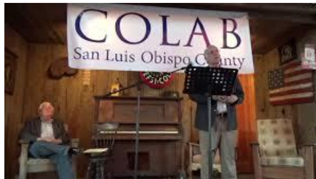
VICTOR DAVIS HANSON ADDRESSES A COLAB FORUM